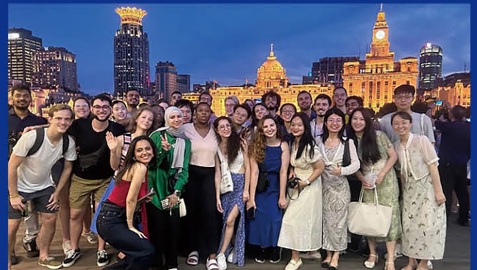
HUANGPU RIVER SCENERY TOURING