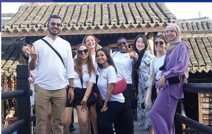
CULTURAL TRIPS AROUND SHANGHAI