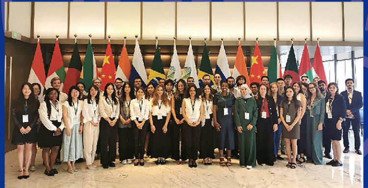
VISIT TO NEW DEVELOPMENT BANK